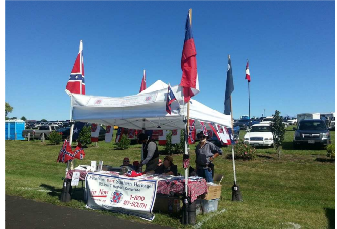
Above: our float in the Jesse James Festival Parade, and our booth at the Festival fairgrounds.