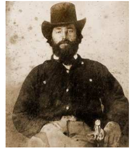
Br. Gen. John T Hughes