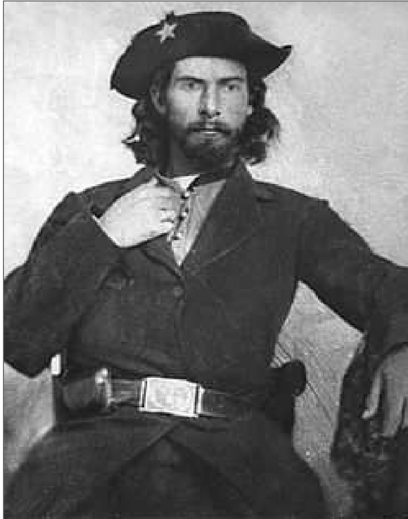
William T. Anderson